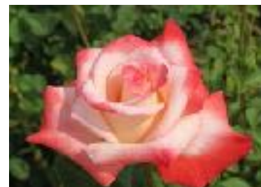
Gemini is the signature rose for the Southern Sydney Region

THE ROSE SOCIETY of NSW Inc. Southern Sydney Region