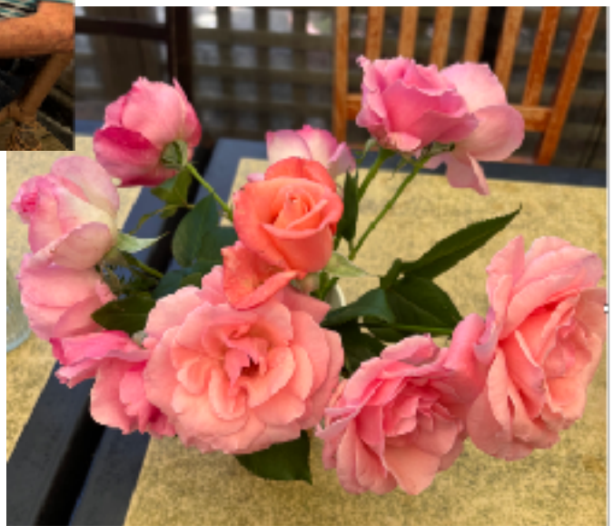
Carol brought some pink roses from her garden - to prove to everyone that she can grow more than just red roses :-)