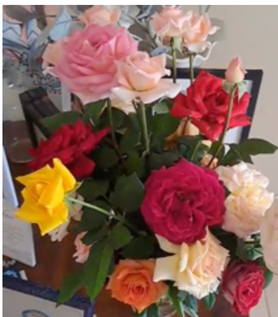
A vase of roses all grown by Joe & Betty Piegza - ask Joe for their names at our next meeting